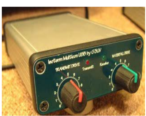
The Isoterm Multi Com by G3LIV

This will run 4 separate instances of EasyPal and a shared